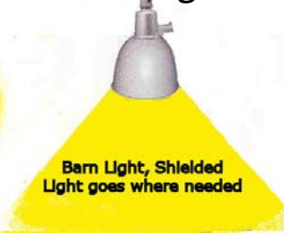
Barn Light, Shielded Light goes where needed