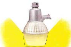
Barn Light, Unshielded Light goes everywhere and causes glare